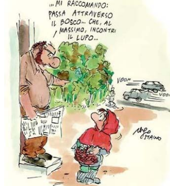
Take care! Go through the wood. If the worst comes, to the worst you will meet the wolf

The aim of the cartoon and drawing exhibition "We all are pedestrians" in Bologna was twofold.